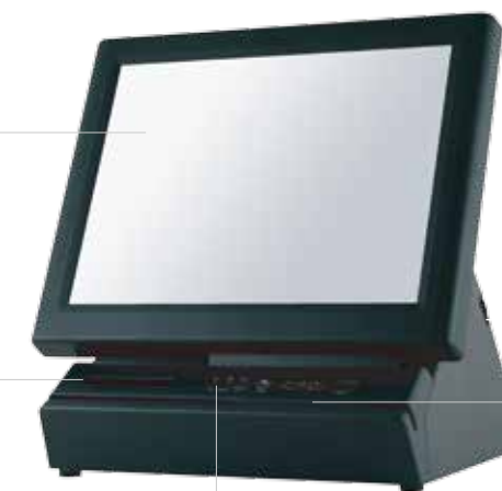
System and printer status LEDs, power switch, brightness control buttons