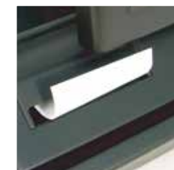
3" thermal printer with auto cutter