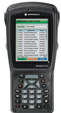
Workabout Pro 4 Short Shown with Numeric keypad.

(Workabout Pro 4 Long is shown on the front page with the Alphanumeric keypad.)