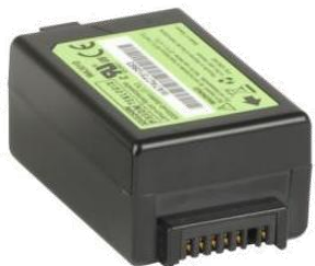
WA3010 Spare battery, 4400 mAh