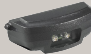
WA9018 1D Linear Imager