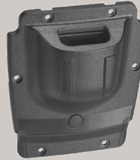
WA9015 1D Standard range laser