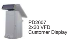
PD2607 2x20 VFD Customer Display