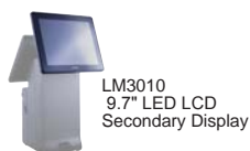
LM3010 9.7" LED LCD Secondary Display