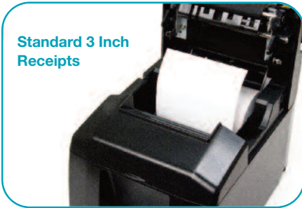
Standard 3 Inch Receipts