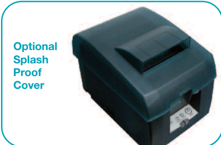
Optional Splash Proof Cover