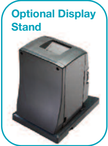
Optional Display Stand