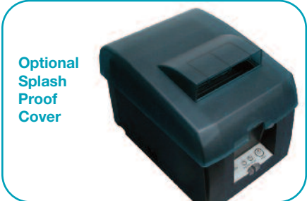
Optional Splash Proof Cover