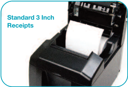
Standard 3 Inch Receipts