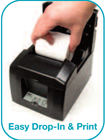
Easy Drop-In & Print