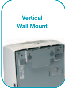
Vertical Wall Mount