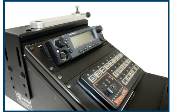
Part # C-EB30-MMT-1P-A shown