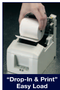
"Drop-In & Print" Easy Load