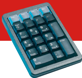
G84-4700 PRB (1)