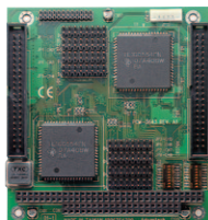
PCM-3643 4/8 RS-232 COM Port Module