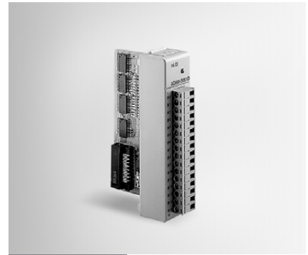
ADAM-5051 ADAM-5051D ADAM-5051S